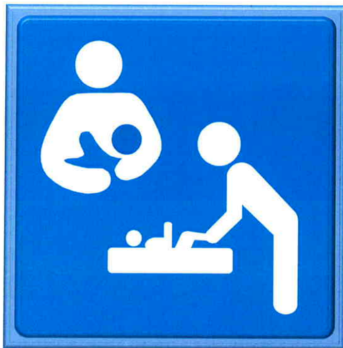
Example of Signage for Babycare Room

Note: Clear text, such as “Babycare Room”/“育嬰間” should be shown on the signage.